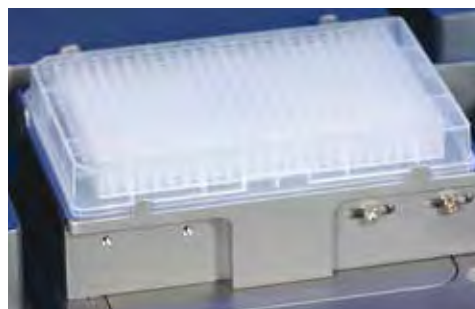
Mirrored Barcode Reader