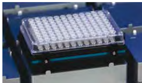
Magnetic Bead Accessory