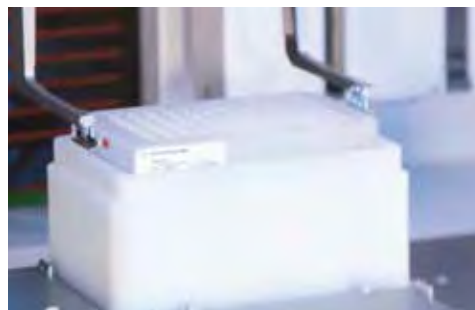
Vacuum Filtration Station