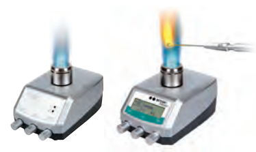
FIREBOY Portable safety Bunsen burner

DOSE IT offers easy handling and straightforward setting of parameters. It is lightweight, fits everywhere in the lab and can be moved easily. The large display and the intuitive user interface make it very easy to set the parameters and operate DOSE IT. Simply choose a dispensing protocol and press run.