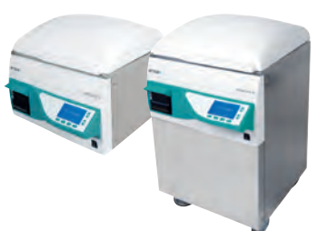
MEDIACLAVE Fast and reproducible media preparation

Available in two models, MEDIACLAVE allows the rapid and gentle sterilization of up to 10 or 30 liters of culture medium. Offering precise controlling and monitoring of temperature and pressure during sterilization, MEDIACLAVE guarantees media of reproducible high quality. Intuitive multilingual user interface and simple programming make it very easy to operate.