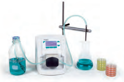
DOSE IT Compact and easy-to-use peristaltic pump

Available in two models, MEDIACLAVE allows the rapid and gentle sterilization of up to 10 or 30 liters of culture medium. Offering precise controlling and monitoring of temperature and pressure during sterilization, MEDIACLAVE guarantees media of reproducible high quality. Intuitive multilingual user interface and simple programming make it very easy to operate.