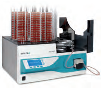
MEDIAJET Reliable walk-away media dispensing system

FIREBOY ensures the highest application safety by providing continuous flame monitoring and overtemperature protection. Electrical ignition is triggered via button or footswitch. In addition, FIREBOY plus has a graphical user interface for convenient operation including setting of a defined maximum burning time. Ignition triggered by an optical sensor allows hands-free operation.