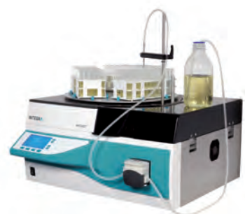
MEDIAJET TUBEFILLER Two applications in one system

MEDIAJET media filling system offers the unique flexibility to fill Petri dishes, Petri dishes with two compartments (Bi-Plates) as well as test tubes of various sizes. MEDIAJET is the perfect complement to MEDIACLAVE as it allows the continuous filling of up to thirty liters of culture medium into Petri dishes.