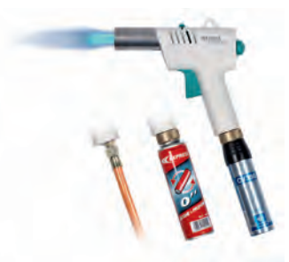
FLAMEBOY Portable flame sterilizer

The unique TUBEFILLER option is the perfect extension to the functionality of MEDIAJET, enabling conversion from a Petri dish filler into a test tube filler in just a minute. It is designed for the continuous filling of various test tube sizes and is suitable for a wide range of dosing applications, including the production of agar slants, broth cultures or NaCl dilutions.