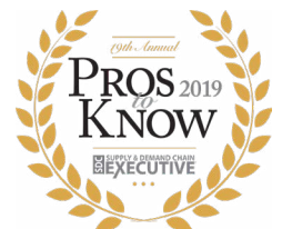
SDCE Pros to Know