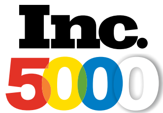
INC. 5000 List of Fastest-Growing Private Companies in America

At HighJump, our legacy speaks for itself. Our 30+ years of experience, plus a proven record of innovation and success, position us as a leader in supply chain solutions. We understand our customers' businesses and provide customized solutions to meet individual needs. With our extensive knowledge of the supply chain of the past and the present, we have the experience, network and drive to lead your company into the supply chain of the future. Our ongoing recognition exemplifies this.