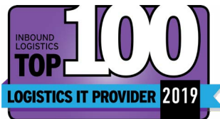
InBound Logistics Top IT Provider