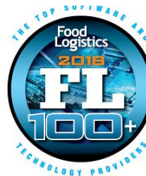
Food Logistics 100