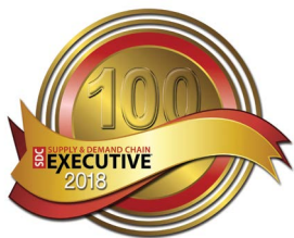
Supply & Demand Chain Executive