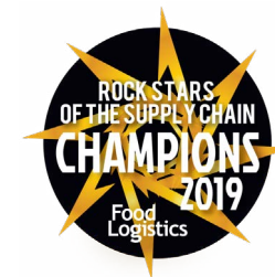
Food Logistics Champions