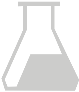
Azure Machine Learning