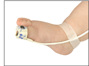
Infant Flex System (2–20 kg / 4.4–44 lbs)

Additionally, the training and implementation process with Nonin Medical was turn-key for our staff. A sales representative gave a quick demonstration with useful handouts on proper use and handling. Our team had no difficulty transitioning to the Nonin Medical brand of pulse oximetry.