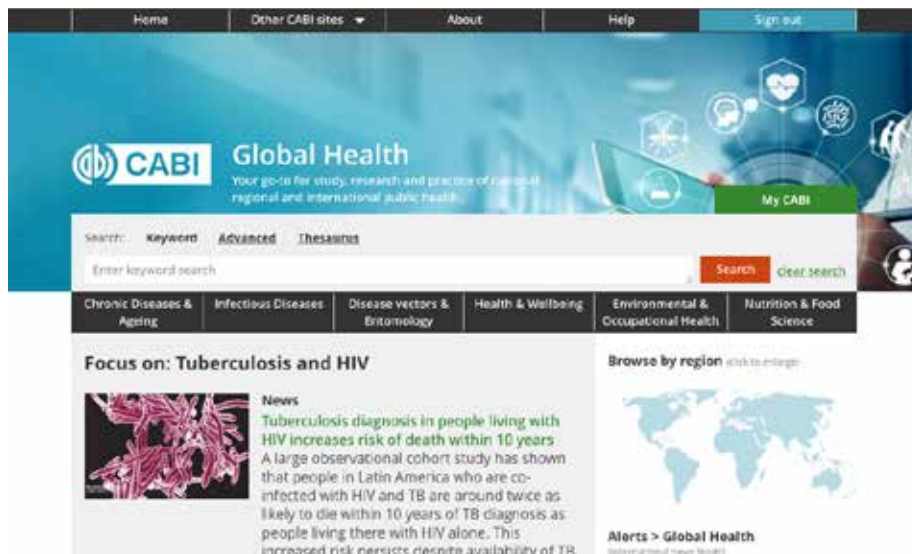
Figure 1 Our new Global Health interface