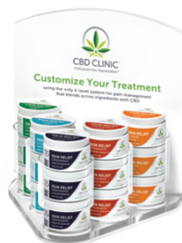
Fully Loaded Display 15 Jars of 44 Gram (1.55oz)

LEVEL 01: Mild, Odor-free | LEVEL 02: Low | LEVEL 03: Moderate LEVEL 04: Extra Strength | LEVEL 05: Maximum Strength