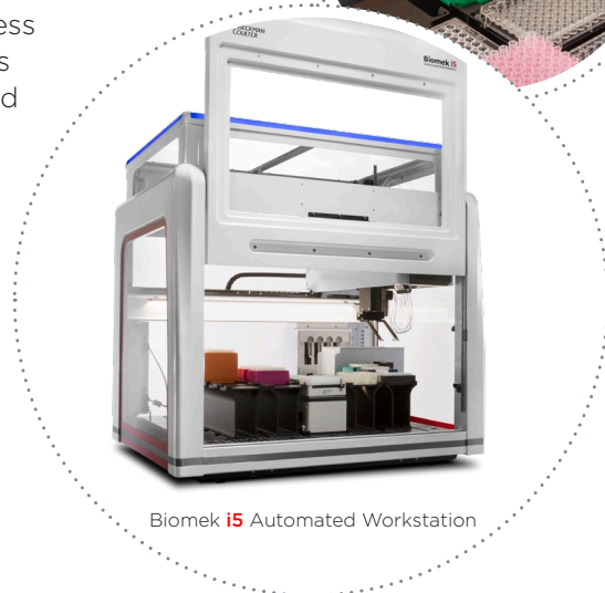
Biomek i5 Automated Workstation