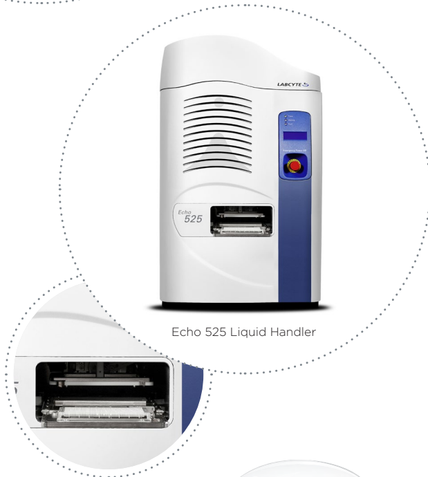
Echo 525 Liquid Handler