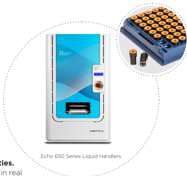
Echo 650 Series Liquid Handlers

Visit beckman.com/liquid-handlers or speak with your Beckman Coulter Life Sciences representative to learn more.