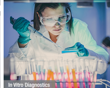
In Vitro Diagnostics