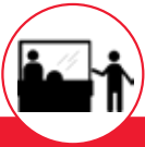
EXHIBIT BOOTHS AND BADGES

The promotional opportunities available to CiDA Exhibitors are designed to address a wide range of business and budgets of all sizes. Contact us at exhibitsales@ccmcme.com for more information.