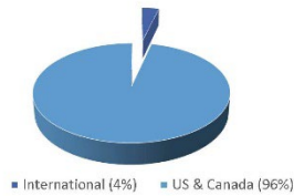
US & Canada vs International