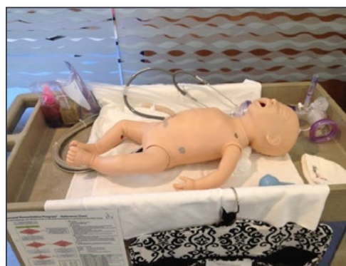
Figure 2. This cart is easy to take to NRP providers on the unit for short periodic practice sessions of skills such as initial steps or PPV with a face-mask and MR. SOPA skills.