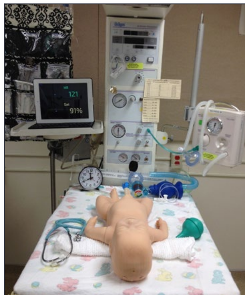
Figure 1. A fully equipped radiant warmer allows 1 instructor and 3-4 learners to practice all resuscitation skills, perform short scenarios as skills are learned, perform the Integrated Skills Station, and practice Simulation and Debriefing.

The NRP skills videos are now available for everyone to view by going to the NRP website ( aap.org/nrp ) and clicking on NRP Skills Videos in the Quick Links.