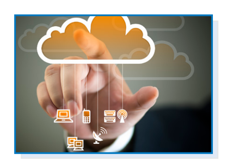
Sensors & Big Data