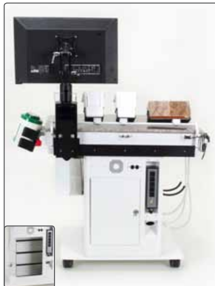
Designer Assistant's Flex System Shown with Optional Sliding Monitor Mount (monitor not included), USB Connectivity, and Rail System Storage Bins & Brackets