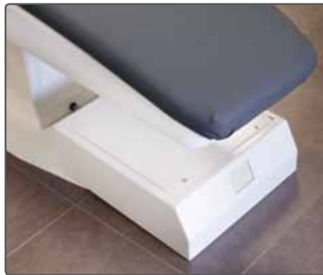
ASI's Floor Utility Junction Box

In-Wall and Floor Junction Box options are available.