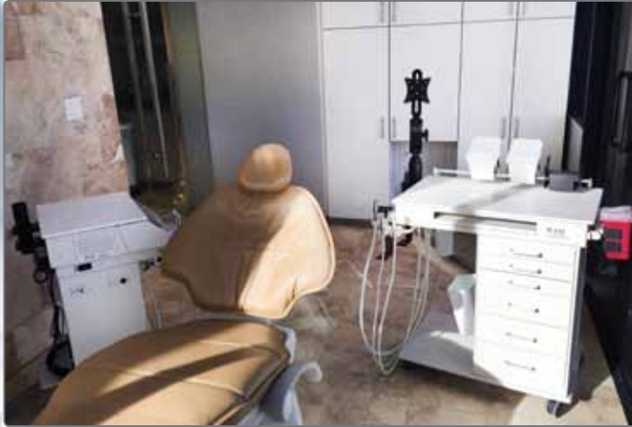
ABOVE: Classic Advanced Dental System® & Classic Flex Assistant System for split delivery.