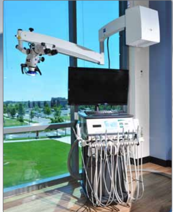
RIGHT: Designer Advanced Endodontic System® with custom instrument integration & left-handed configuration. Designed for side delivery.