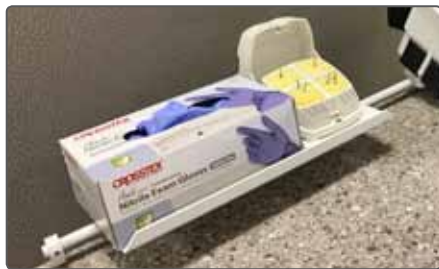
Rail Storage System Accessories Tray