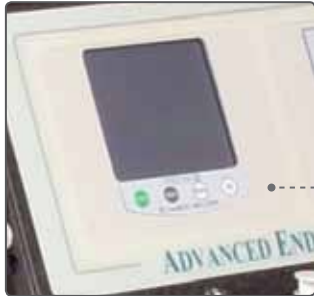
Root ZX II

These fully functioning systems come standard with air driven handpiece connections, an air/water syringe and an air only syringe. ASI's unique modular panel allows full instrument integration. Your selected instruments are placed in the order you choose and include a specialized instrument holder. Operation is streamlined through a single foot control.