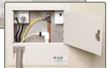
ASI's In-Wall Utility Junction Box