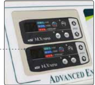
Dual Electric Motors