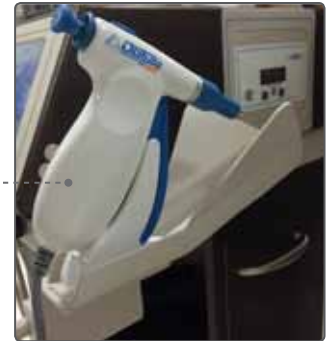
Integrated obturation with specialized heat shield