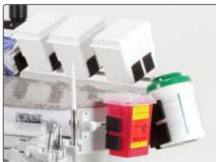
ASI's Unique Rail Storage System Allows Custom Configuration with an Array of Storage Options