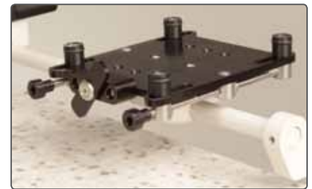
ASI's Vice Bracket is designed for small table top instruments such as apex locators. Various mounting options available.