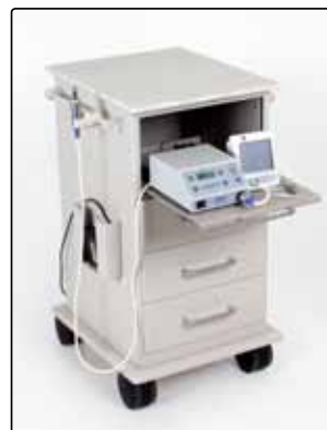
Slimline in Colorado Beige with Wilsonart® worktop. Shown here with electric motor and apex locator (not included).