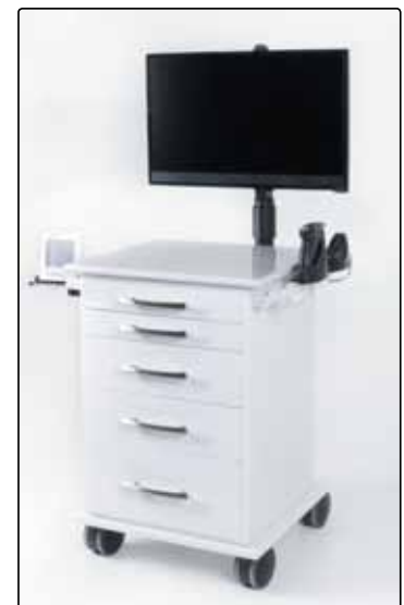
Standard in White, shown with optional Silestone worktop upgrade (comes with Wilsonart®). Custom configuration with monitor mount, apex locator on vice bracket, B&L gun and cordless heat tip charging base and handpiece holder.