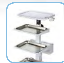
Powered Trolley: pg 15

Package Discounts Available Call Today! 866.244.2954