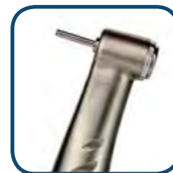
AHP-72S-FO: pg 19