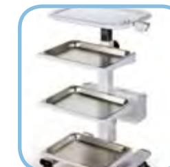
Powered Trolley: pg 15

Package Discounts Available Call Today! 866.244.2954