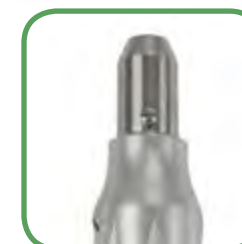
AHP-101: pg 32