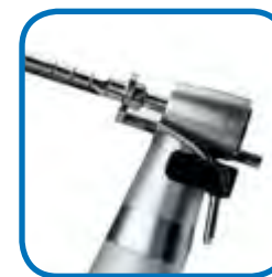
Handpieces: pg 8