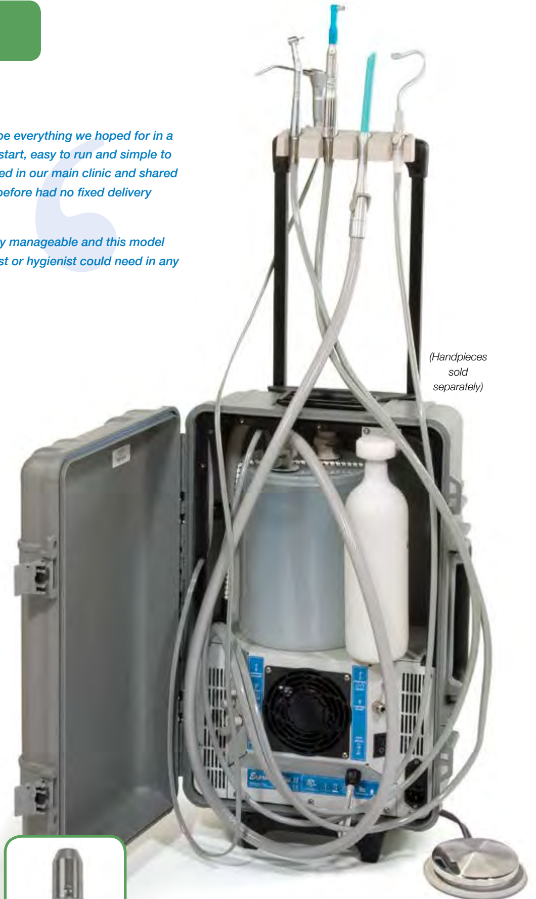
(Handpieces sold separately)