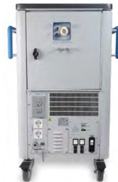
(Handpieces sold separately)