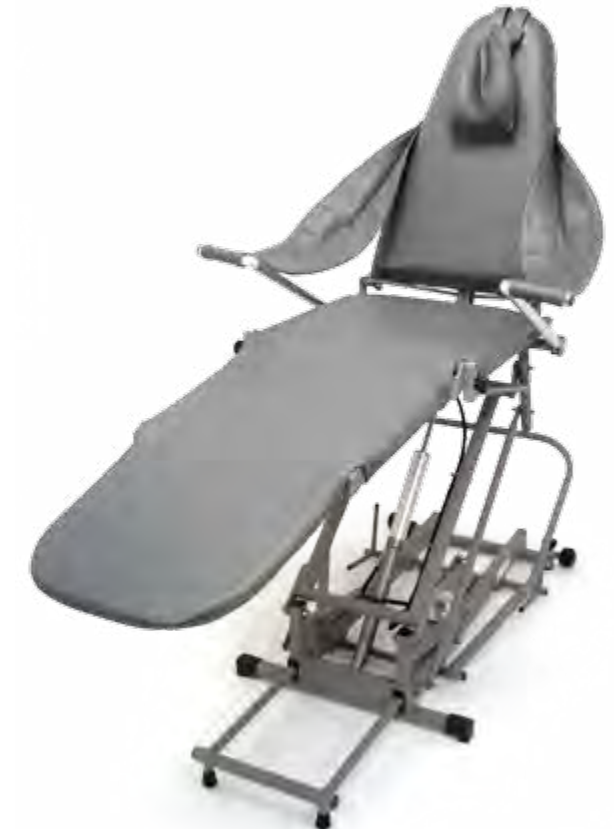
ADC-02CF - Hydraulic Patient Chair Foot actuated hydraulic lift mechanism NSN: 6520-01-652-8993