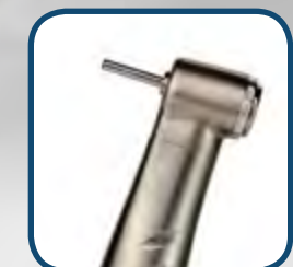
AHP-72S-FO: pg 19