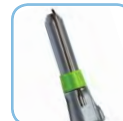
AHP-77W: pg 13