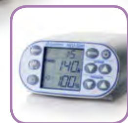
AEU-5000: pg 43