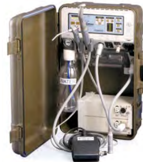
AEU-14CF - Expedition Ultralight solar powered dental unit.