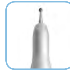
AHP-64: pg 12