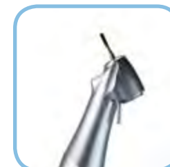
AHP-79W: pg 13