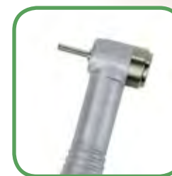
AHP-55: pg 32