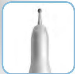
AHP-64: pg 12