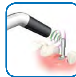
Penguin RFA: pg 2