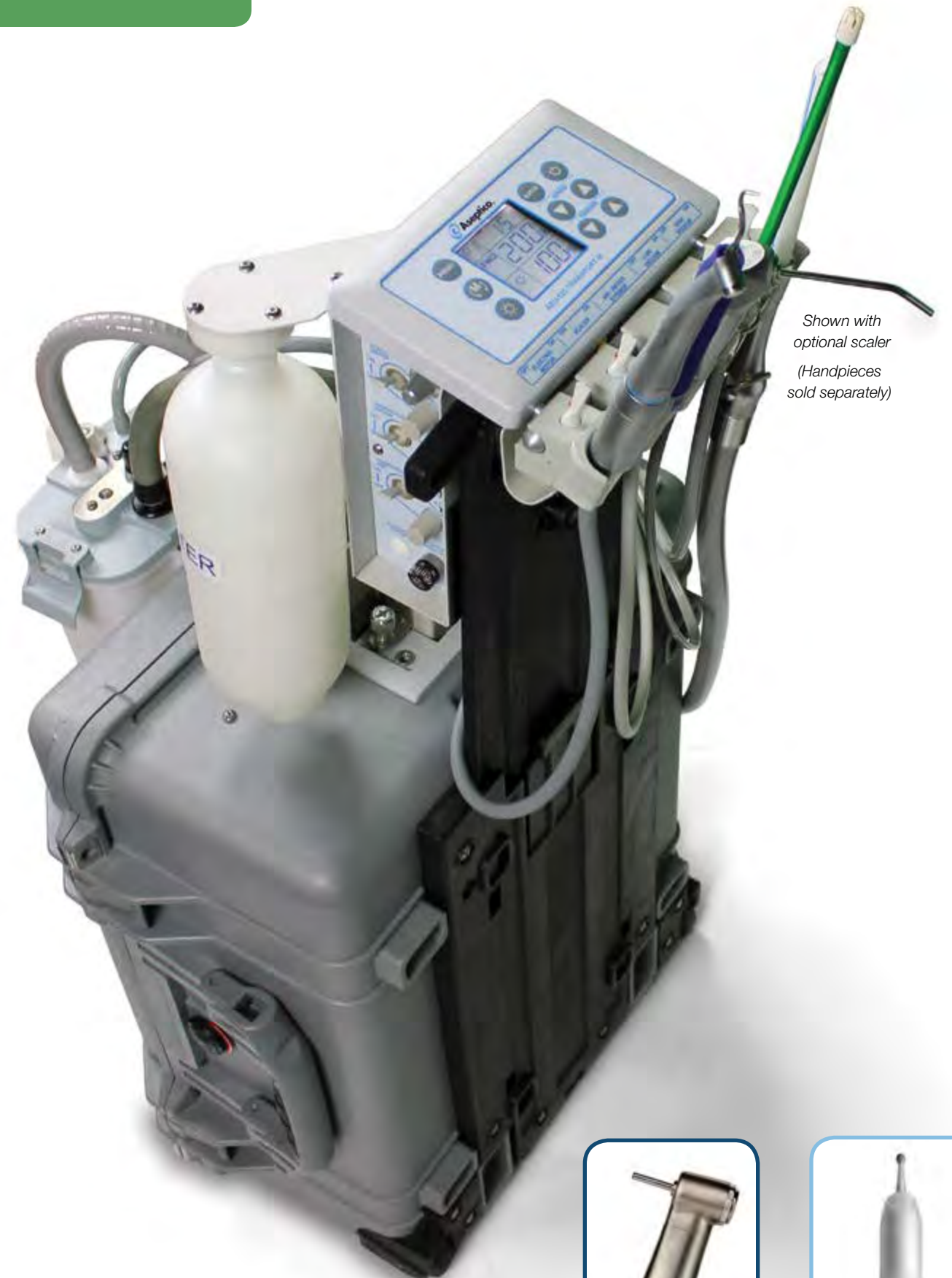
Shown with optional scaler (Handpieces sold separately)