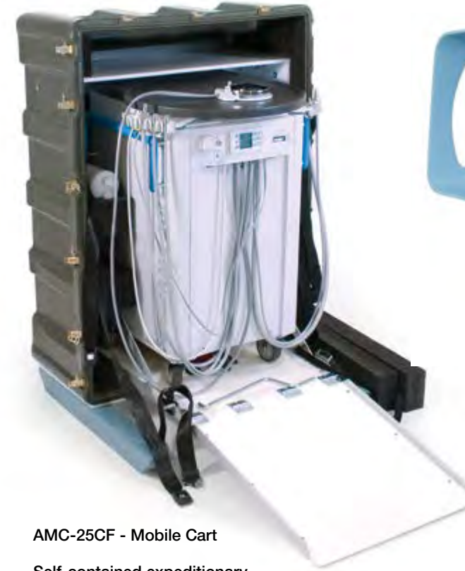
AMC-25CF - Mobile Cart Self-contained expeditionary operatory.