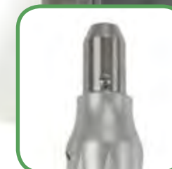
AHP-101: pg 32