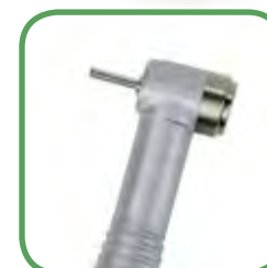
AHP-55: pg 32