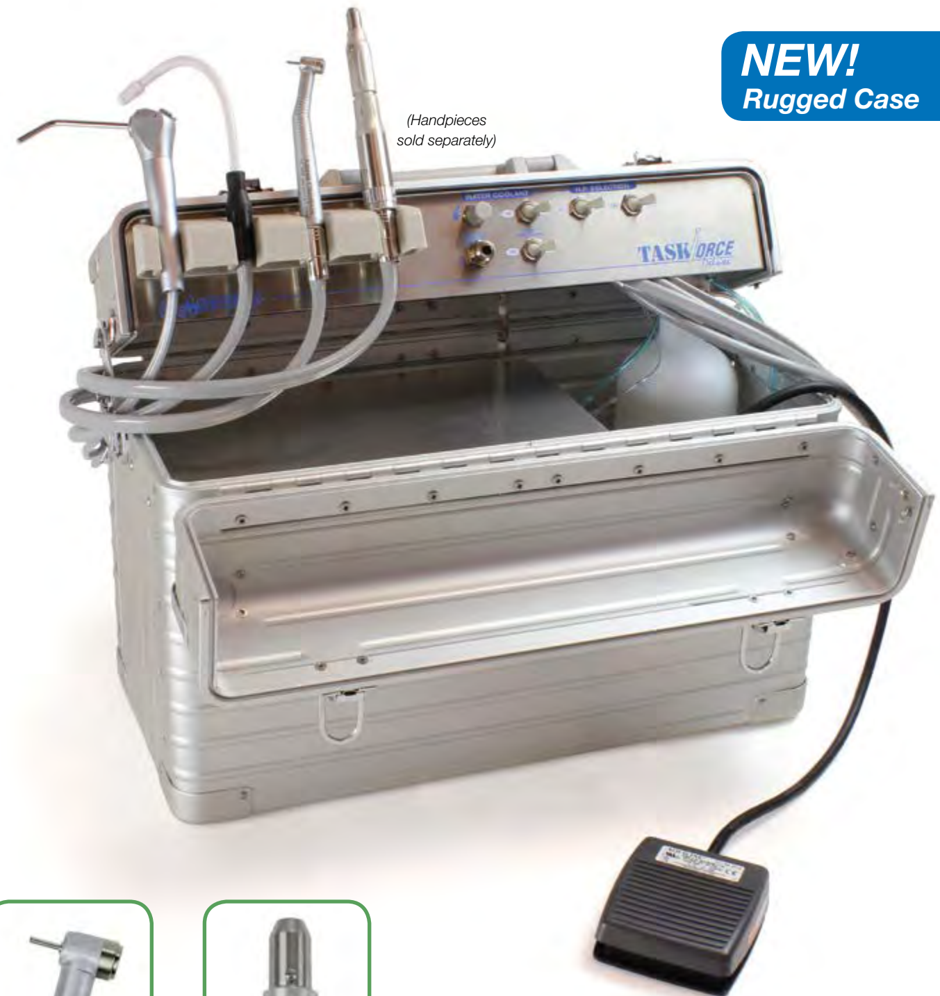
(Handpieces sold separately)