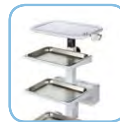
Powered Trolley: pg 15