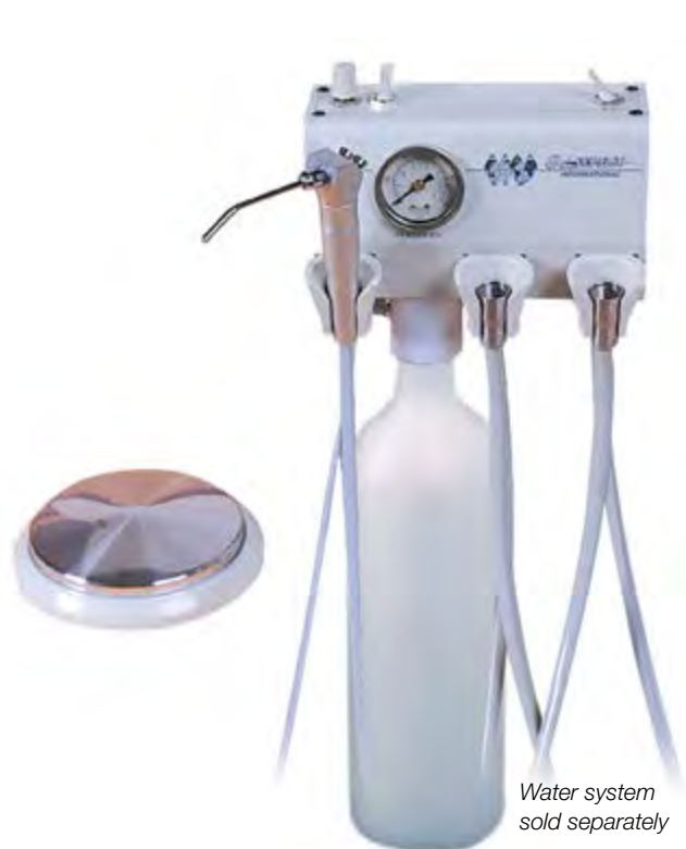
Water system sold separately