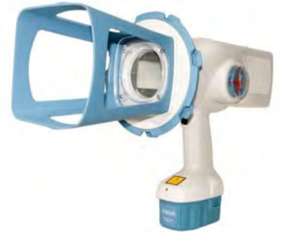
ARU-500MD - Nomad MD Hand-held medical field x-ray.