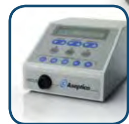
AEU-25: pg 16