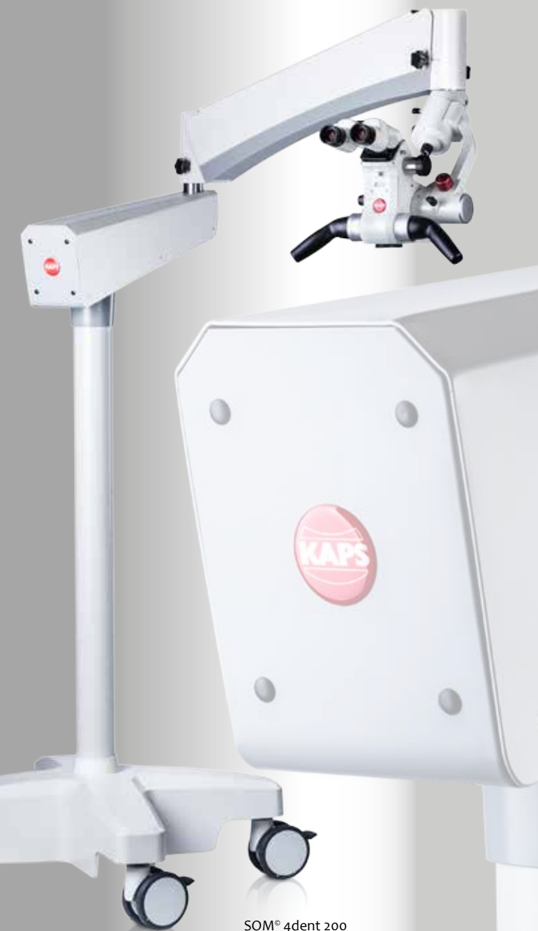
SOM® 4dent 200