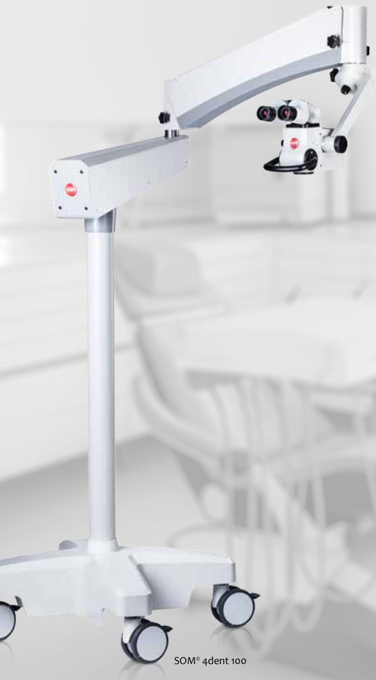
SOM® 4dent 100

The new SOM® 4dent range of Karl Kaps dental microscopes stands for ergonomics and quality.