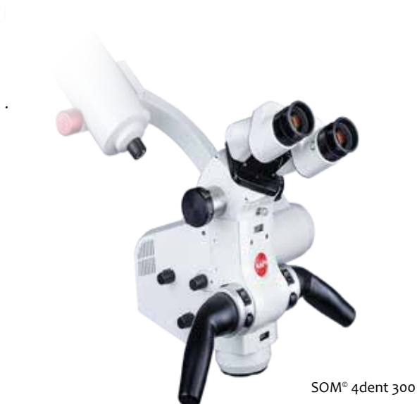
SOM® 4dent 300

The Kaps SOM® 4dent dental microscopes are also ideal for joint practices. Through the use of an ergonomic handle, varioscope and inclinable tube, several users can work with the microscope without time-consuming retooling, and everyone continues to benefit from an ergonomic working environment.