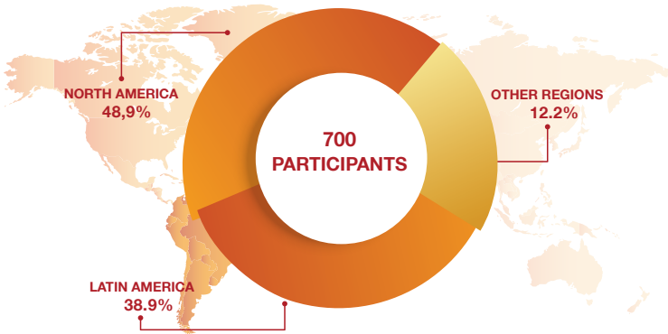
CAEI LAS VEGAS 2023